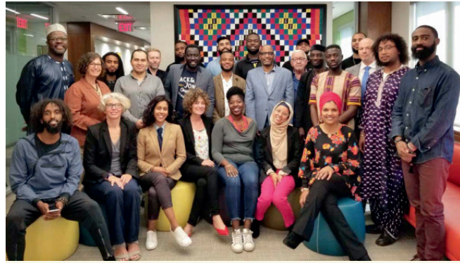
"Africa, Globalization, and the Muslim Worlds" participants