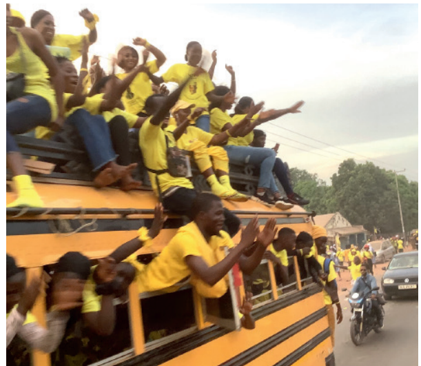
Gambian voters bound for the polls in Banjul

This corporatist-strategic approach helped Barrow leverage and exploit the country's endemic poverty. For example, he raised the hopes of average Gambians—who can barely afford two square meals a day—by promising to raise wages to 3,000 dalasi (US$57.31) per month and provide ambulances, milling machines, rice, and other foodstuffs. Meanwhile, he deflected the opposition's criticism by co-opting more moderate groups from among both minority and majority ethnic groups. The strategic procedures started shortly before voter registration and continued throughout the electoral campaign. Thus, Barrow exploited